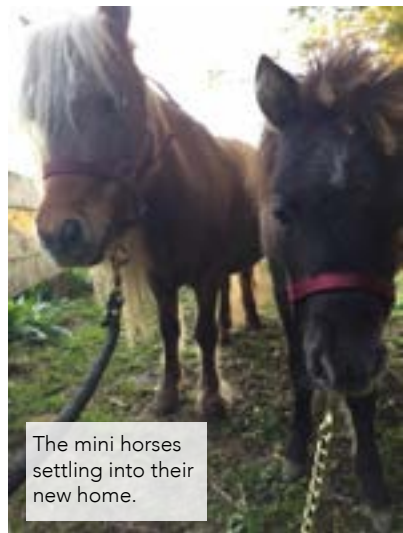
The mini horses settling into their new home.