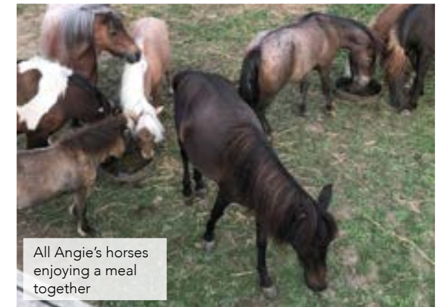
All Angie's horses enjoying a meal together