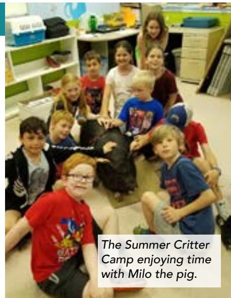
The Summer Critter Camp enjoying time with Milo the pig.

Registration opens soon! Check out guelphhumane.ca/education/ for more details.