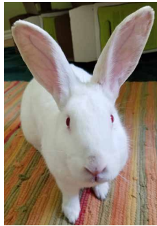
Bunny mom and her babies, Spring 2019.

Rabbits can become pregnant at just 6 weeks old! Also, a rabbit's gestation period is only one-month long. Litters can be as big as 3-12 babies, called kits. Further, bunnies can