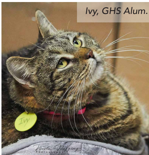
Ivy, GHS Alum.

Contact us to learn more on how you can host an event in support of GHS!